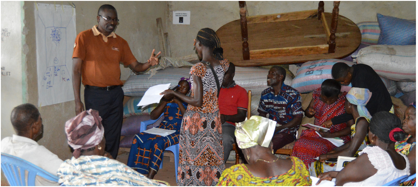
A Working Group during GALS training in Zaranou.