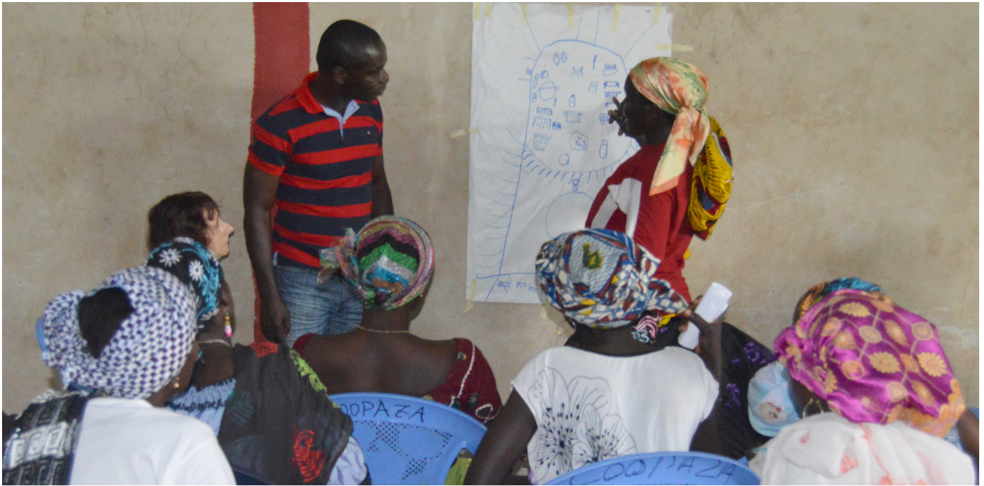
A working group in Zaranou.

means that some women relying drawing for written communications, together with participatory and analytical skills they need to develop their own plans. The GALS methodology needs to focus on developing confidence in these areas first. Once that is done, experience elsewhere suggests the rest can come quite fast.