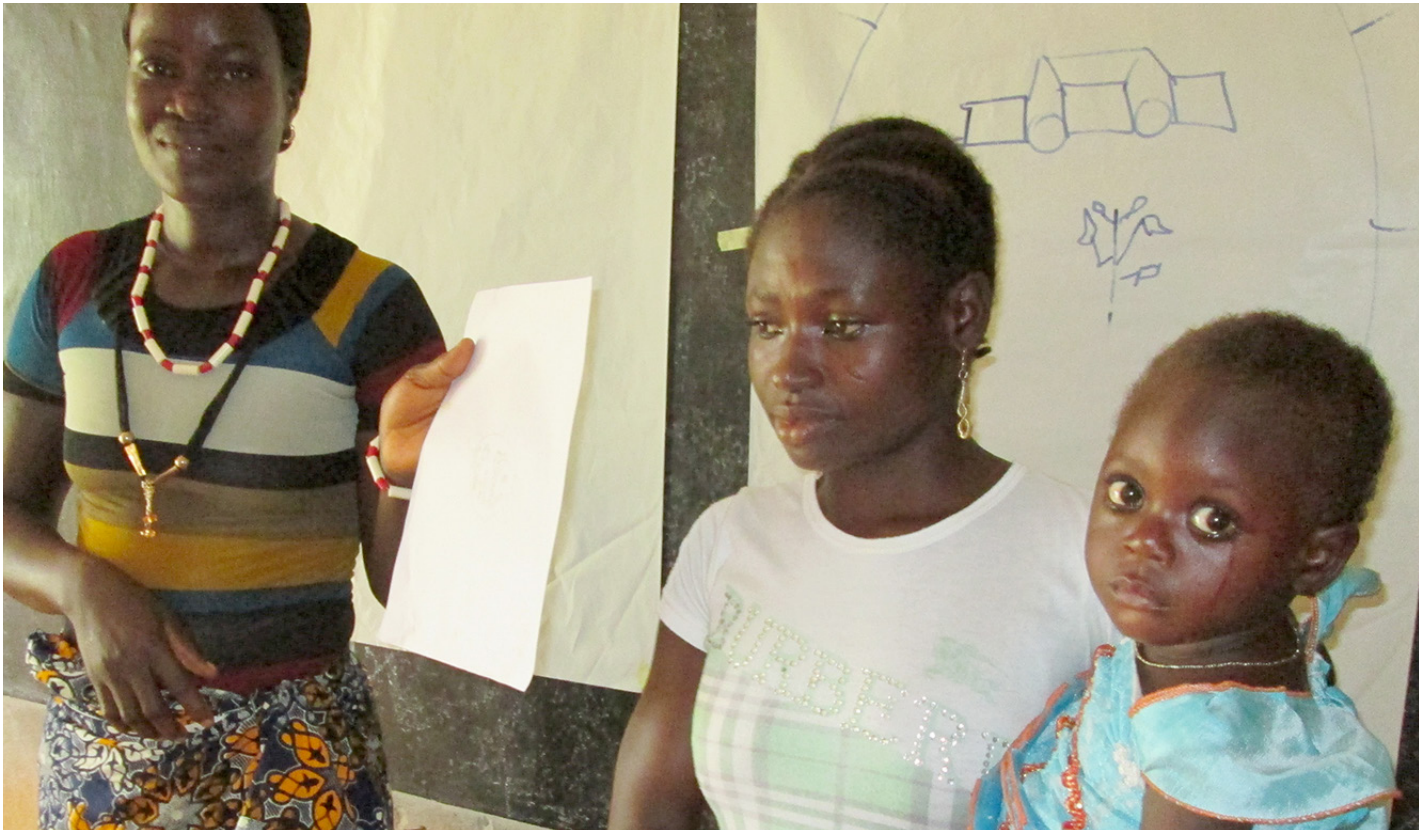
Women presenting their vision.

The workshop used another tool, the Challenge Action Tree, to analyze the eight activities that emerged from the Soulmate Visioning.